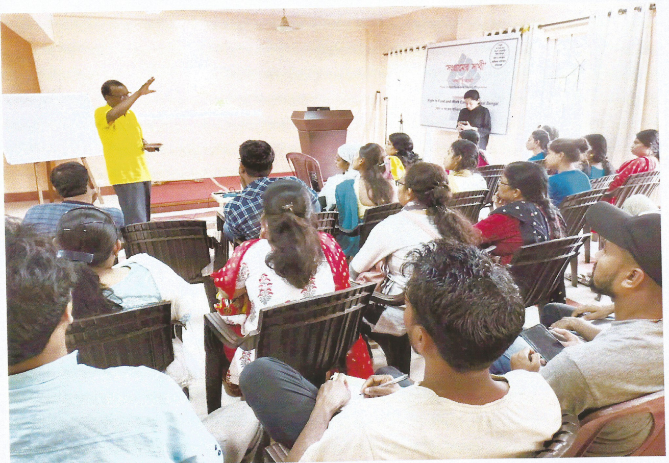
Right to Food Campaign in North Bengal