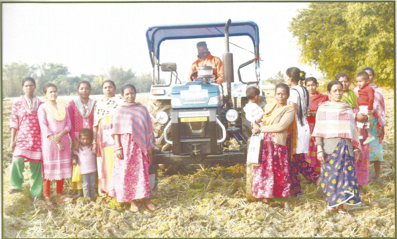
SOCIAL AGRICULTURE PROJECT with Women SHGs