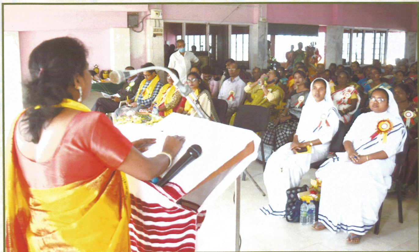
International Women's Day celebration in Rajdeep Hall, Bagdogra