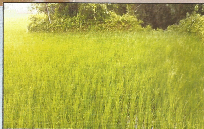
The picture file is from Taipoo , Birsing Jote Farm unit